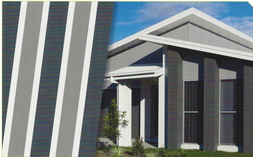
architexture classic canvas collection